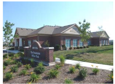
Fountains Office Park