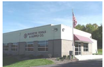
Buckeye Tools & Supply Co.