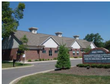
Dayton Plastic Surgery Center