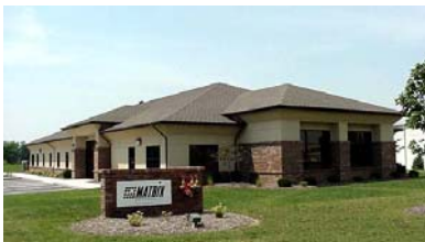
Matrix Risk Consultants