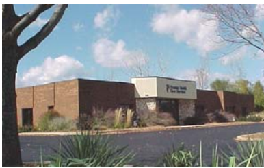
Premier Health Care