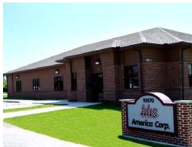
Baumer HHS America Corporation