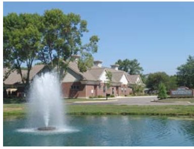
Washington Township Office Park