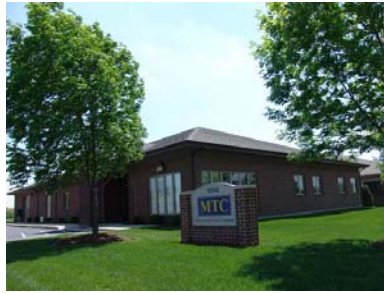
Mackintosh Tool Supply