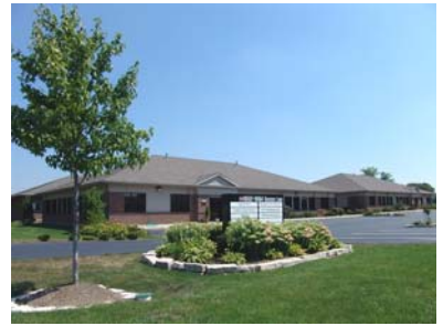
Success Lane Business Park