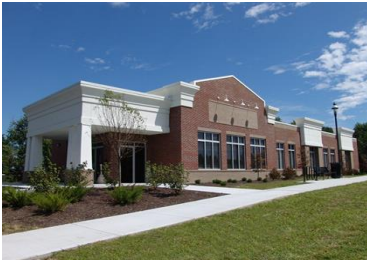
Medical Office Building, Union, KY