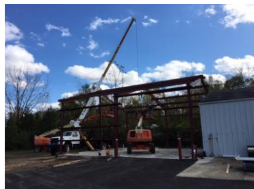
Industrial, Miamisburg, OH